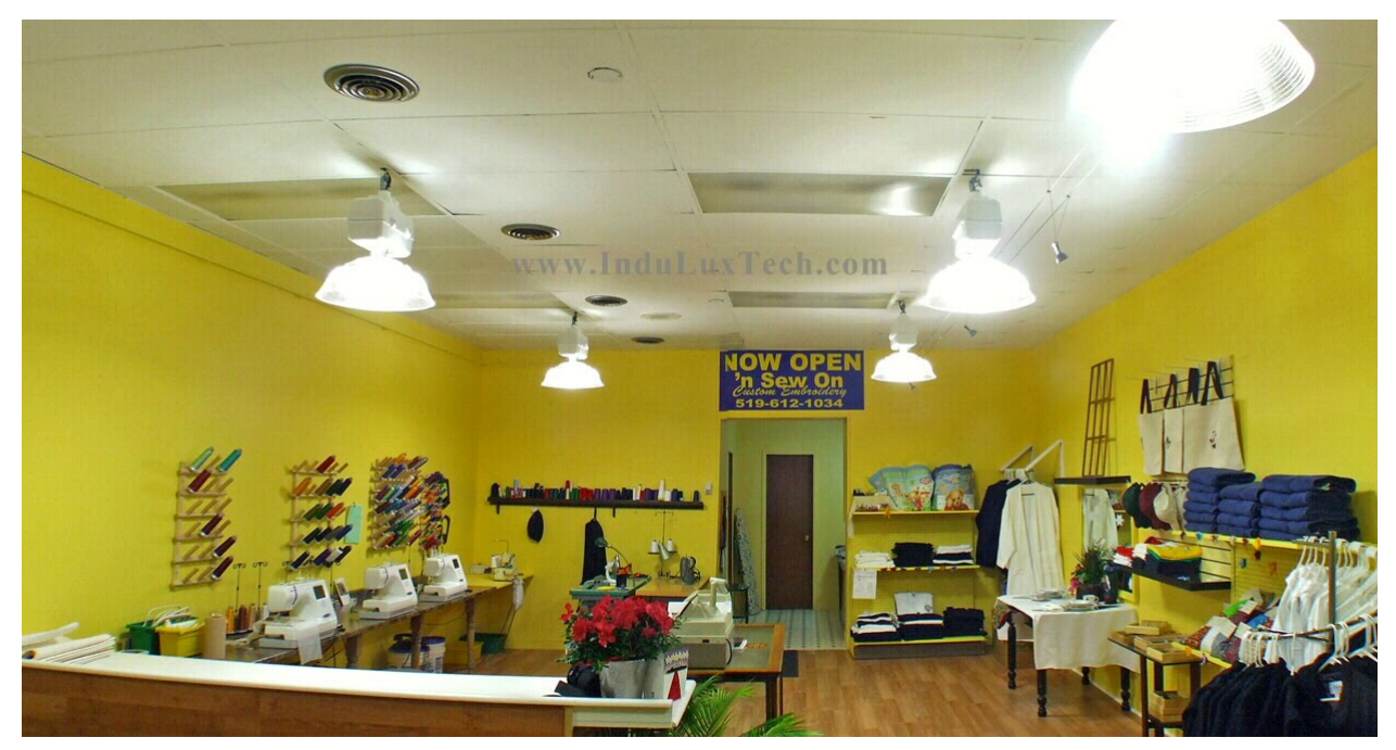
AFTER the upgrade: A view of the store where 5 of the induction low-bay fixtures are visible. Note that the light distribution is now more even and the space is much brighter.