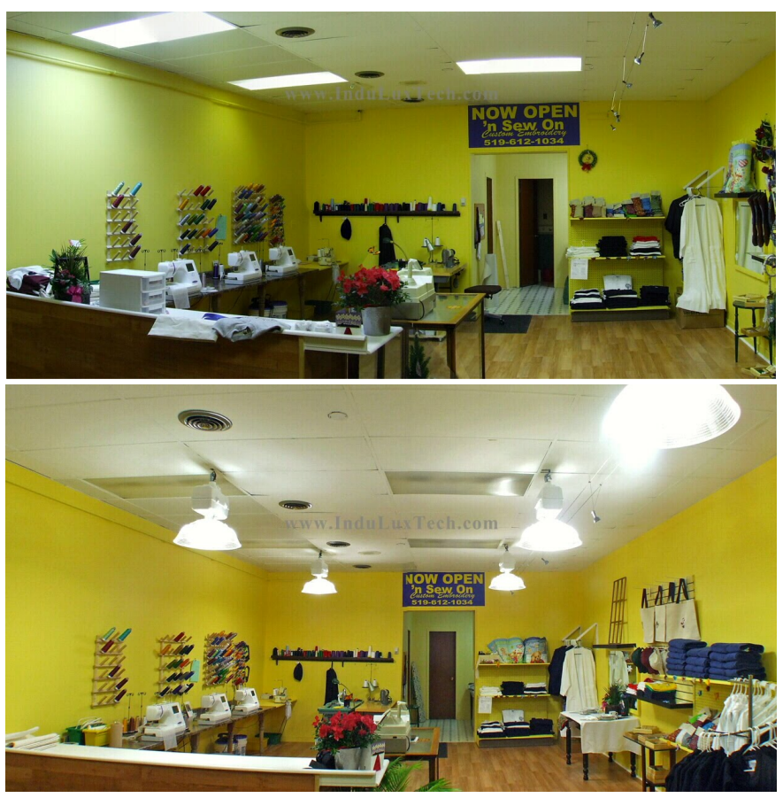
TOP: Retail store before upgrading to Induction Lighting BOTTOM: Magnetic Induction fixtures installed in the retail store